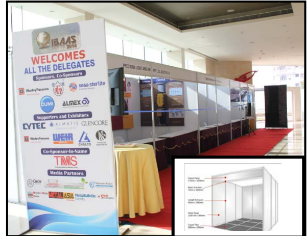
Past Conference Exhibition & Visual Scheme

At the venue of IBAAS conference, exhibition is being organized showcasing the developments of aluminium industry in India and world over. Fully furnished aluminium framed stalls of 2mx2m size would be available for interested companies. More than 200 delegates from India and abroad are expected to participate in this International mega event. The tariff for exhibition stall is as follows: